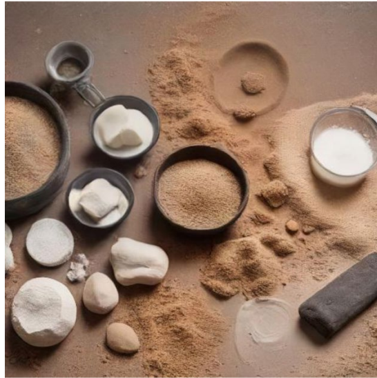
Figure 3: Task on Checkpoint 3.