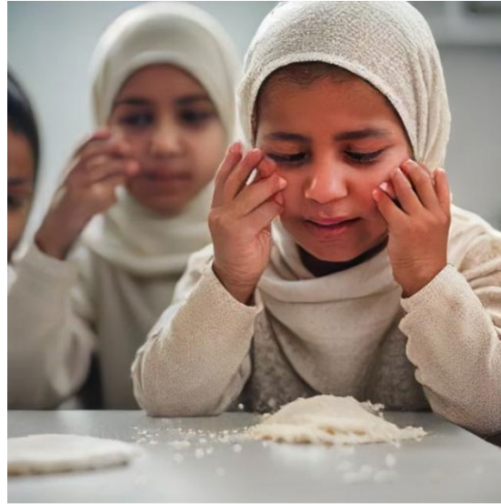
Figure 5: Task on Checkpoint 5.