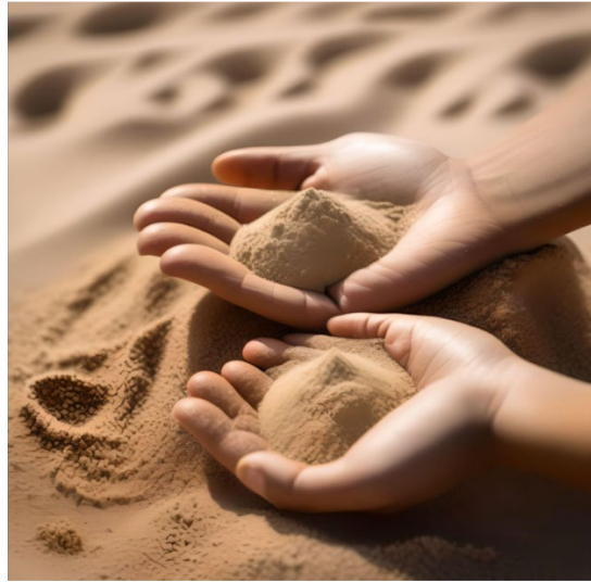
Figure 4: Task on Checkpoint 4.