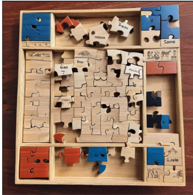
Figure 2: Task on Checkpoint 2.